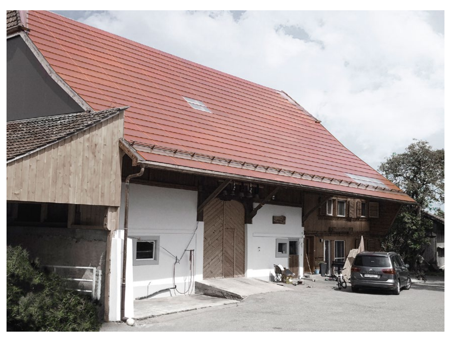
Farmhouse Ecuvillens (Switzerland)