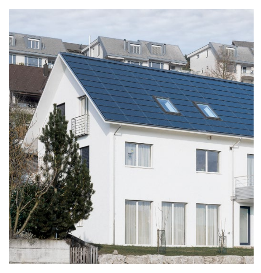
Single-family home Obersiggenthal (Switzerland)