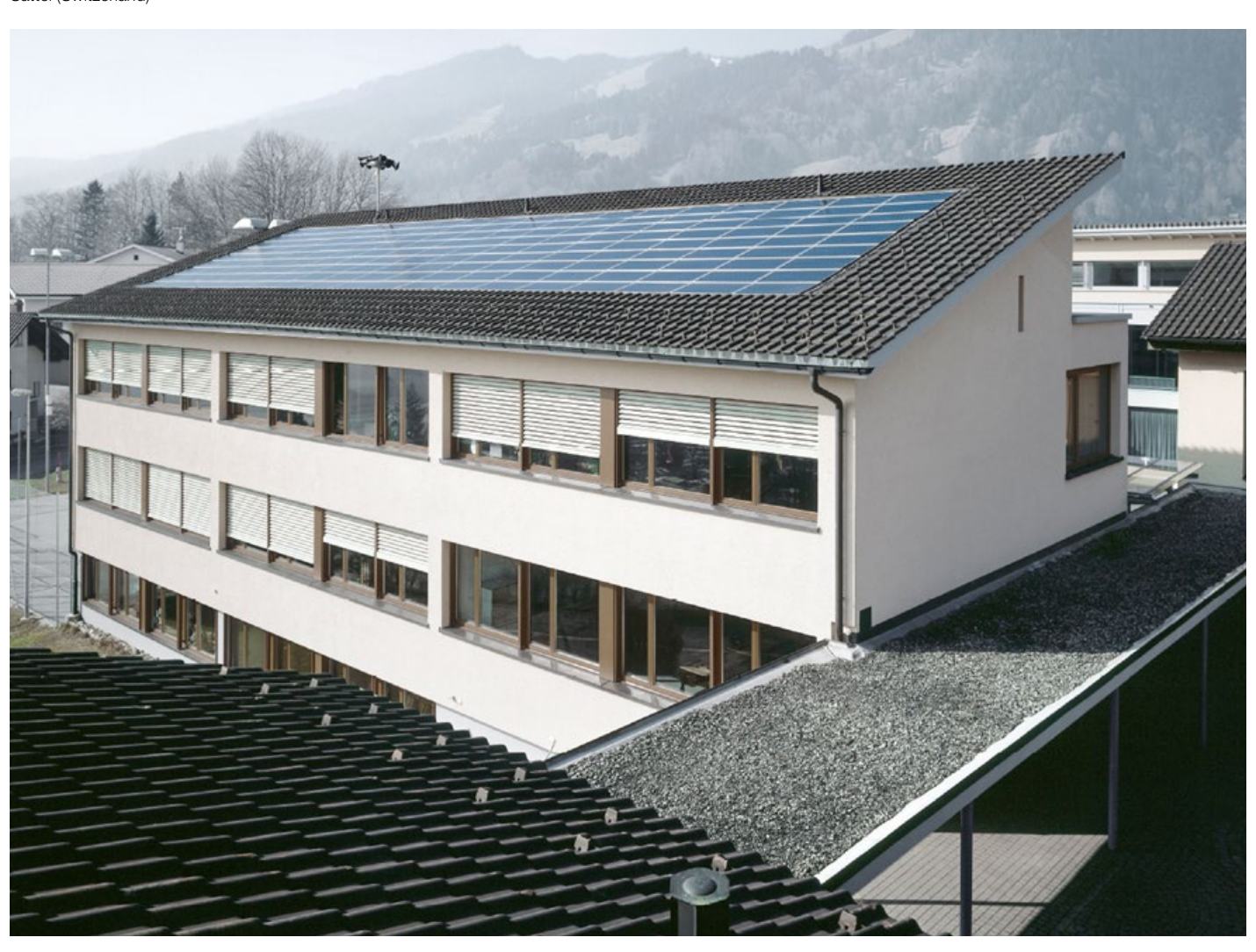
Eggeli school building Sattel (Switzerland)