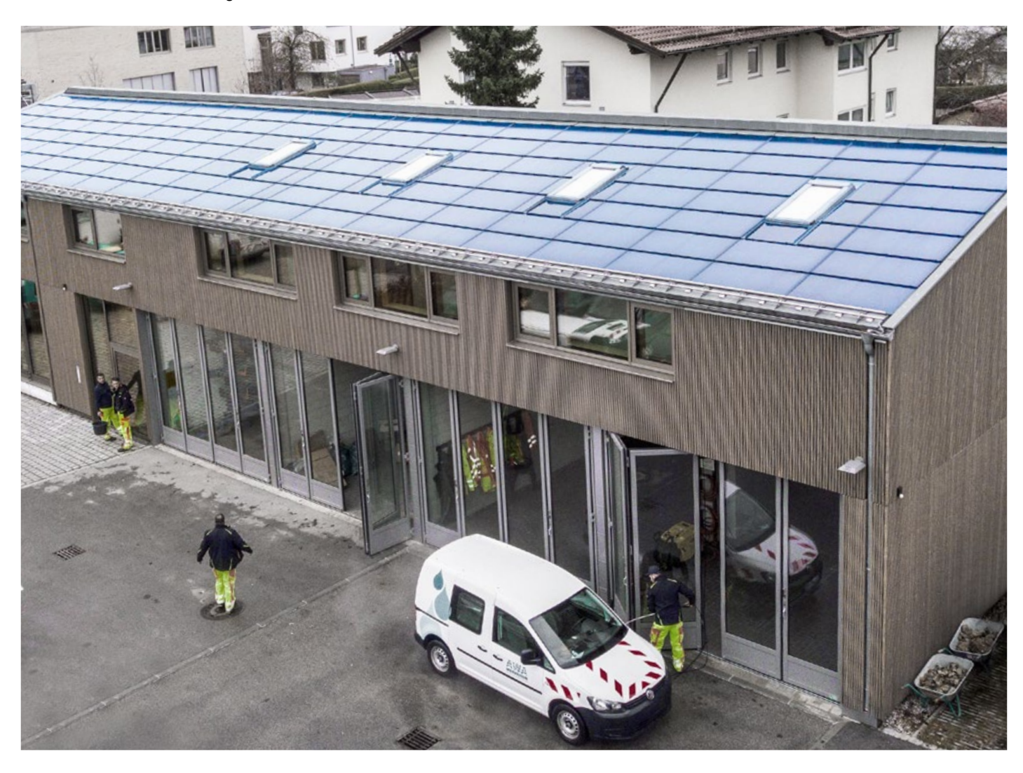
AWA-Ammersee Wasser- und Abwasserbetriebe gKU, operations building (municipal drinking water supply and wastewater treatment plant) Herrsching (Germany)