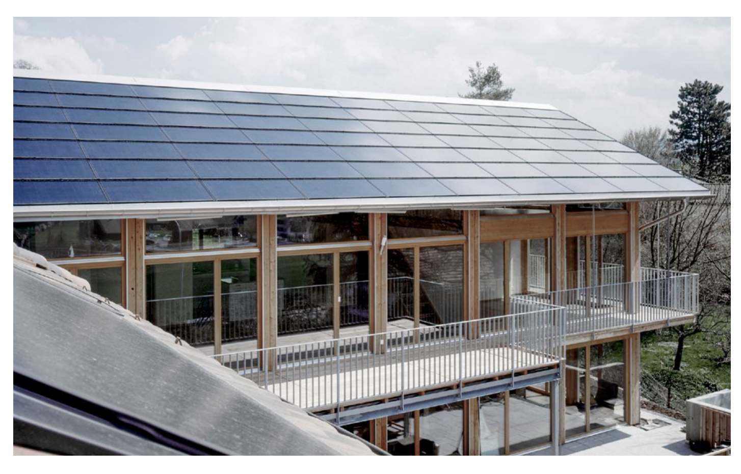
Single-family home Kappel (Switzerland)